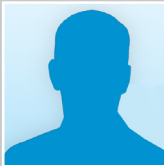
COMMUNICATIONS SPECIALIST Now Hiring!